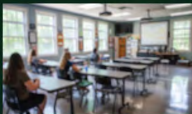
FLEXIBLE & ADAPTIVE LEARNING SPACES