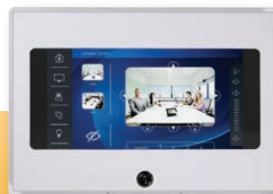
Fits Q-SYS TSC-70-G3 touch screen controller