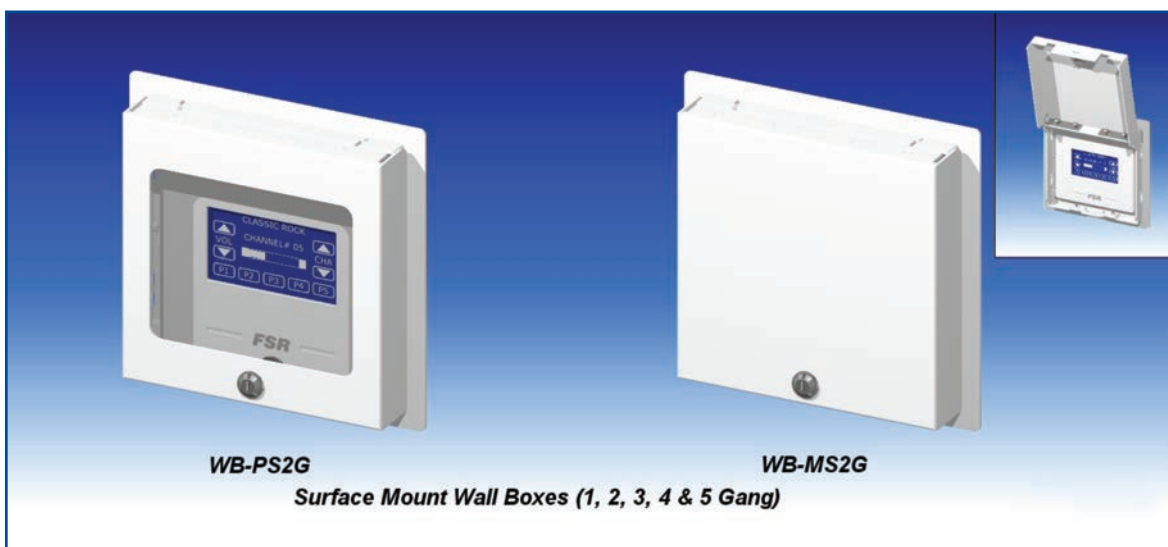
WB-PS2G WB-MS2G Surface Mount Wall Boxes (1, 2, 3, 4 & 5 Gang)