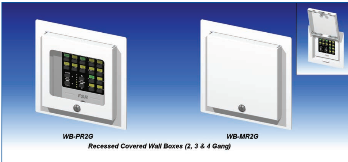
WB-PR2G WB-MR2G Recessed Covered Wall Boxes (2, 3 & 4 Gang)

The Wall Box series offers 18 different models to fit your needs. Everything from recessed to surface mounts are available for new or existing construction. We have addressed the rising issue of network security with models featuring a locking metal door, available with or without a clear acrylic window in models with two or more gangs. The window can be used as a view port, allowing the operator to effortlessly monitor the status of the control panel mounted in the box without opening it. The WB Series is an effective way to secure and protect wall plates and data plates with multiple network connections. They may also be used to mount other touch plates.