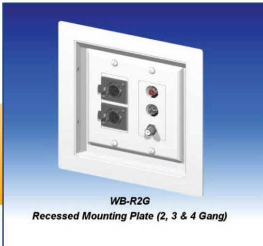
WB-R2G Recessed Mounting Plate (2, 3 & 4 Gang)

The Wall Box series offers 18 different models to fit your needs. Everything from recessed to surface mounts are available for new or existing construction. We have addressed the rising issue of network security with models featuring a locking metal door, available with or without a clear acrylic window in models with two or more gangs. The window can be used as a view port, allowing the operator to effortlessly monitor the status of the control panel mounted in the box without opening it. The WB Series is an effective way to secure and protect wall plates and data plates with multiple network connections. They may also be used to mount other touch plates.