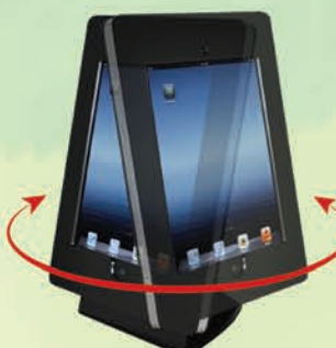
Swivel version Enclosure can Swivel 90° Left and Right