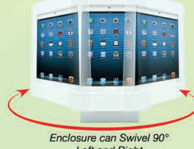
Left and Right