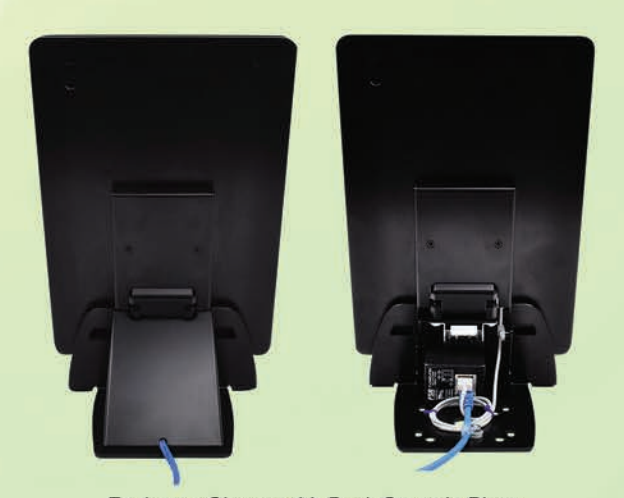
Enclosure Shown with Back Cover in Place and Open to show PoE to USB Charger

The table mount enclosures are available for the iPad 2. 3rd and 4th generation iPads, or iPad mini mobile digital devices, and can be ordered with a white or black finish.