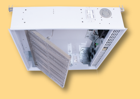
CB-22+ with Dual Tilting Shelf to access cabling