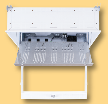
CB-22+ Repositionable 2-RU Rack Rails