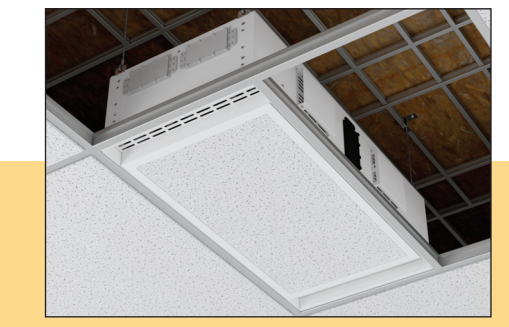
CB-12-PTF with acoustic ceiling tile