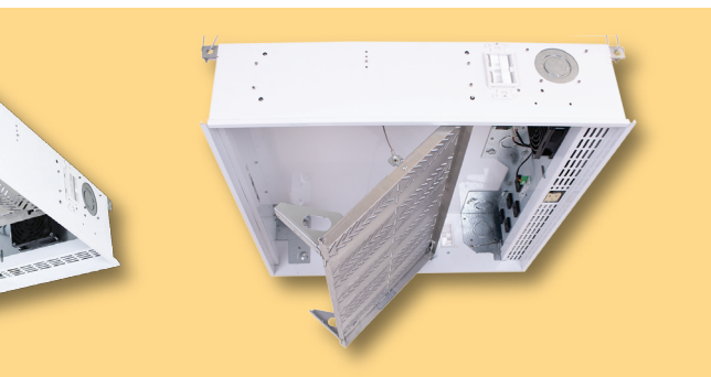
CB-22+ with Dual Titling Shelf to access punch panels