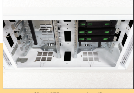
CB-12-PTF 90° mount in soffit