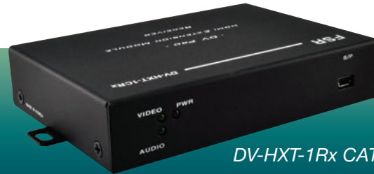
DV-HXT-1Rx CAT-x Receiver