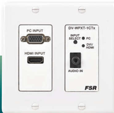
DV-WPHXT-1CTx-WHT Wallplate Transmitter