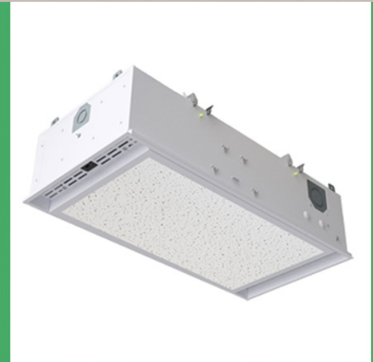
CB-12 with acoustic ceiling tile