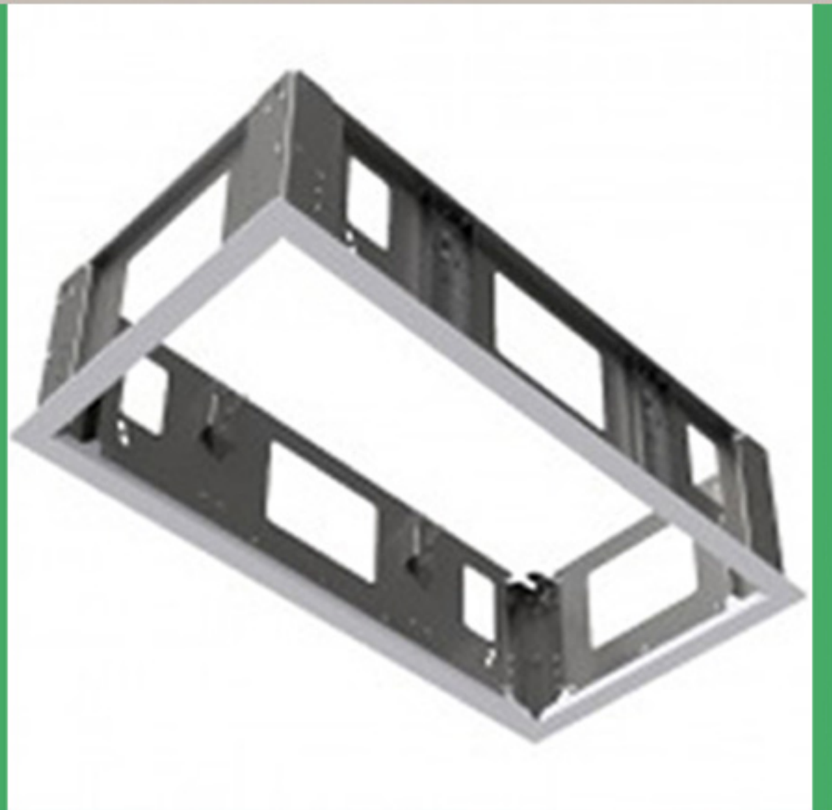
Drywall Mounting Frame CB-SR12