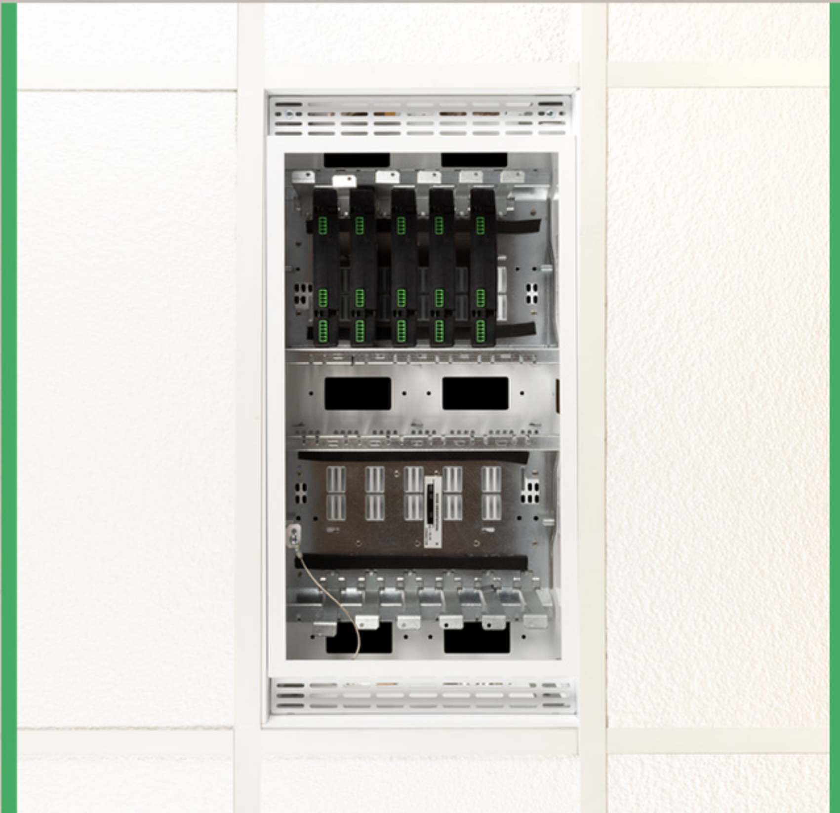
CB-12-PTF 90-degree mount in soffit