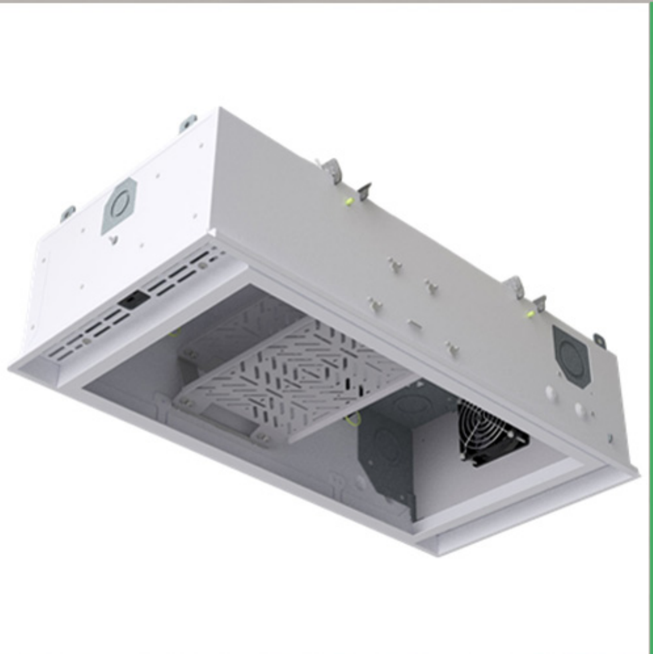
Standard Ceiling Box - FSR CB12